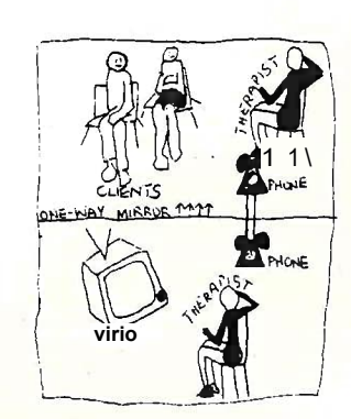
FAWL7 THfR.APY MAP