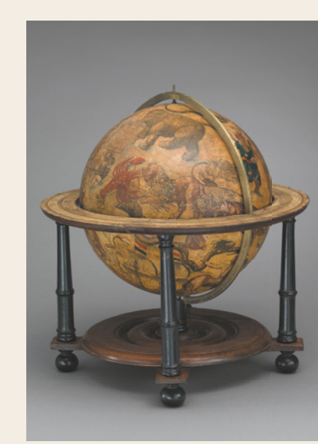
Willem Janszoon Blaeu Celestial globe After 1621. Collection of the Metropolitan Museum of Art, New York, purchased by Friends of European Sculpture and Decorative Arts Gifts, 1990