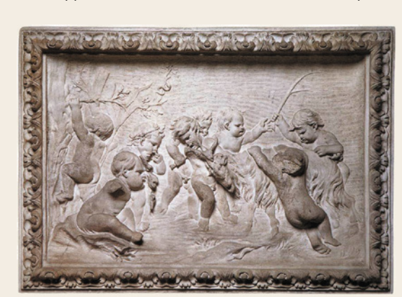
François Duquesnoy Putti Teasing a Goat 1626. Marble basrelief. Galleria Doria Pamphilj, Rome

The original for the sculptural relief at the base of Dou's composition is by Flemish sculptor François Duquesnoy. The (now damaged) relief once included a putti (cherub) with a bearded mask, teasing the goat, which is restrained by the other putti. Dou is thought to have worked from a plaster copy of Duquesnoy's sculpture, many of which found their way into artists' studios. Its inclusion is believed to reflect Dou's desire to position painting above sculpture, through his impressive powers of illusionism. The putti relief appeared in a number of Dou's window niche paintings.