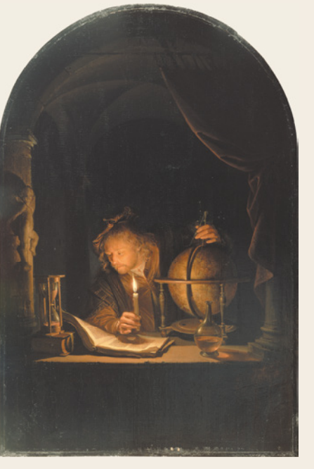
Gerrit Dou Astronomer by Candlelight Late 1650s. Oil on panel. The J. Paul Getty Museum, Los Angeles

Europe believed that the movements of the stars could affect events on earth, including weather, crop growth and the workings of the human body. European doctors learned to check positions of the stars before making a diagnosis; by the late 1500s, they were also required by law to calculate the moon's position before performing medical procedures like surgery or bleeding.