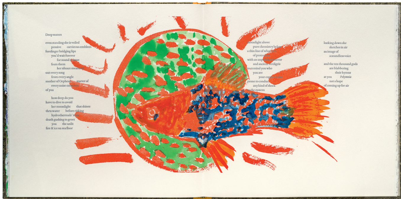
2. Fishwork 2009