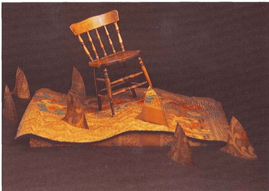
That Old Familiar Feeling