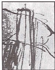
Drawing Out of Context. Forthcoming Exhibition. 4 June - 7 July 1996.

Art in the Heart of Christchurch April, May, June 1996 - 201