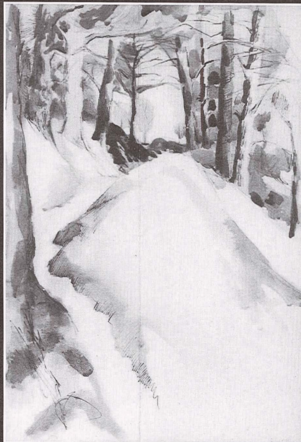
Philip Trusttum Red Berries Oil, Garden Series 1973