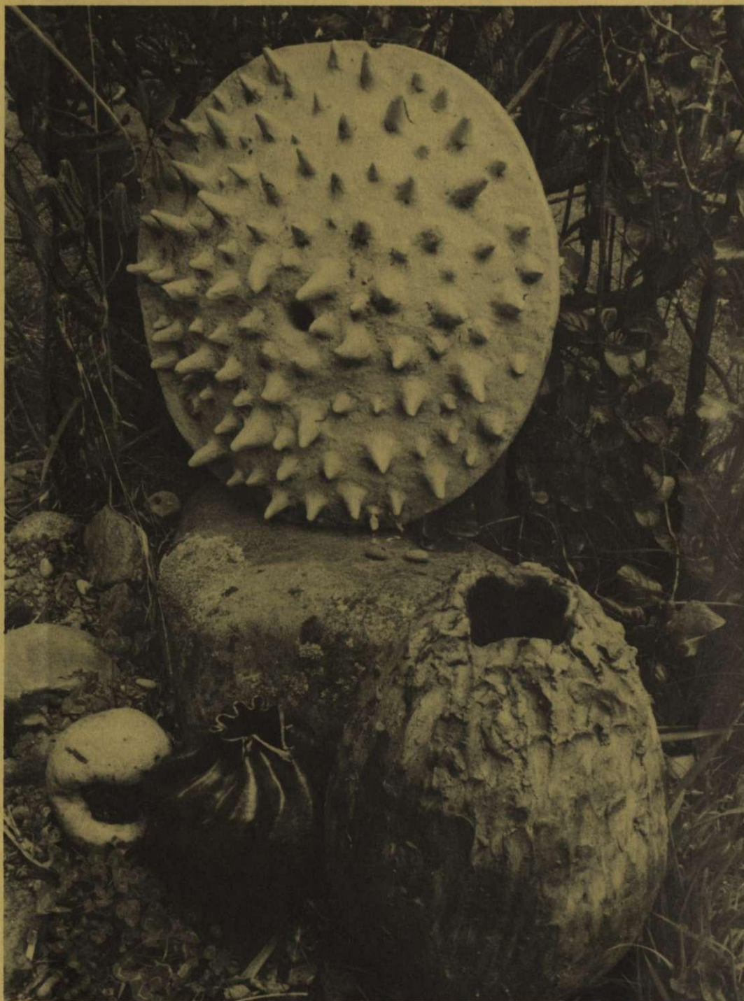
A cluster of pots in the Brokenshire garden

He used to work out thoroughly in drawings what he was going to do but found that this compressed his ideas too much. Now he does just a few sketches and allows the clay to work its own way out. He has often worked in series producing groups of similar objects. A group of small heads set in a triangular pattern create a fierce atmosphere where singly they are quiet and harmless. Clusters of pots and sculptures around the garden look far more at home than in any gallery. Many are filled with water to give an idea of coolness in the summer.