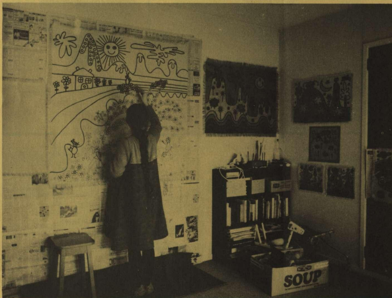
Laksami Milas working with oils on hessian (Exhibition 1-14 December)