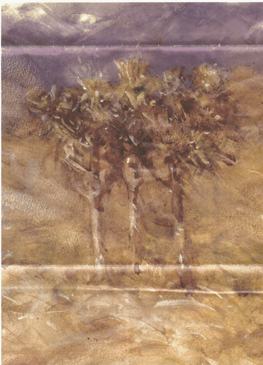
Detail from 'Cabbage Trees, Clarence Valley, Kaikoura', Margaret Stoddart.

The Robert McDougall Art Gallery P.O. Box 2626 Christchurch Fax (03) 365-3942 Telephone (03) 365-0915 Botanic Gardens Christchurch