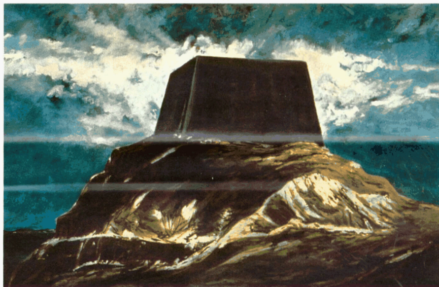
From the 'Bunkers Series', Caroline Williams

Williams' works are often characterised by vast and brooding landscapes in which alien fortress-like structures seem to belong in some unknown, but enigmatic, drama. Although seemingly set in the physical world the solid bunkers and chambers are often placed in brooding landscapes of craggy