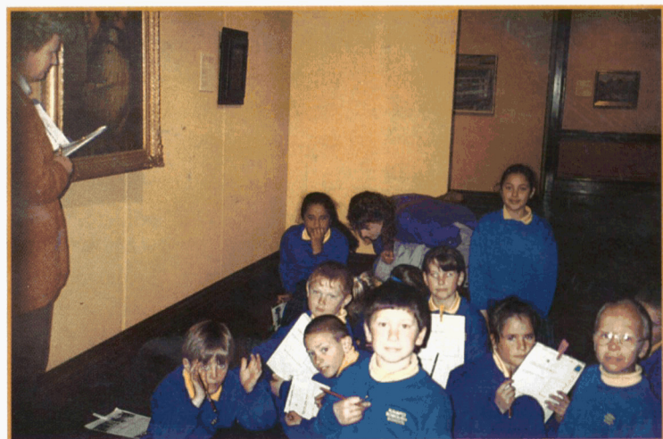
Pupils from Year 3/4 Kaiapoi Borough School enjoying a lesson at the Gallery