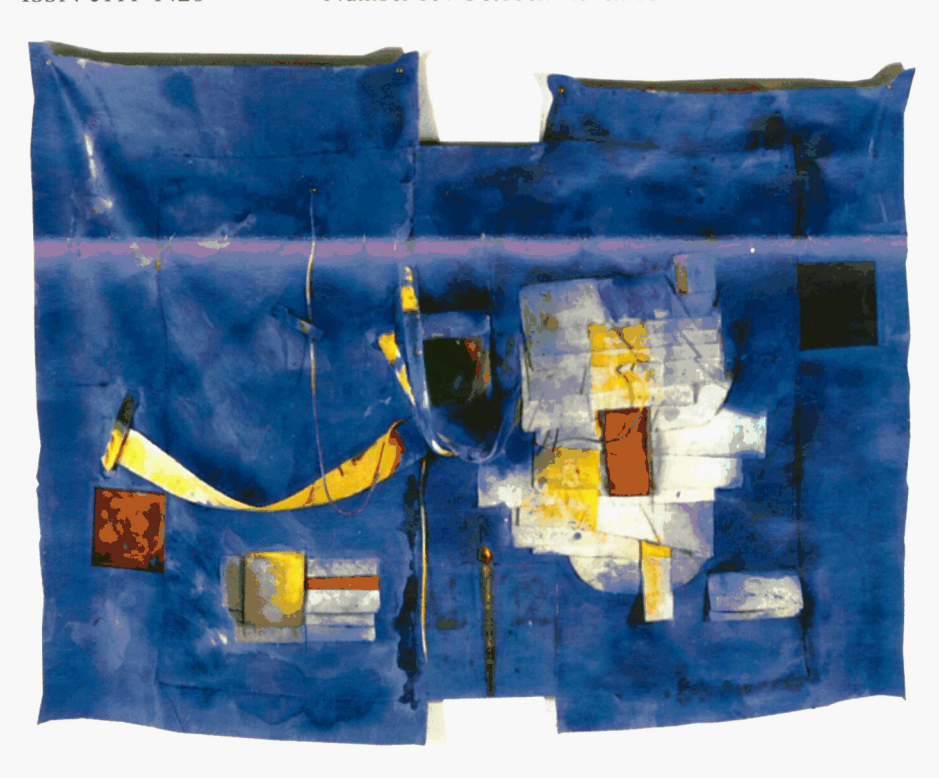
Don Peebles, Untitled Canvas Relief Painting. 1996.