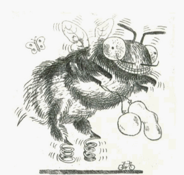
B bounced to it