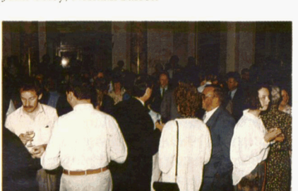
Guests at the opening preview