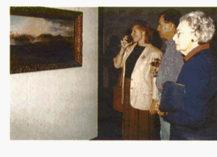
Viewing Centre North