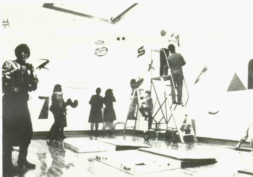
The installation of a Killeen work.

This promises to be an evening with a difference — chances are the Christchurch Killeen will inevitably be different from all others!