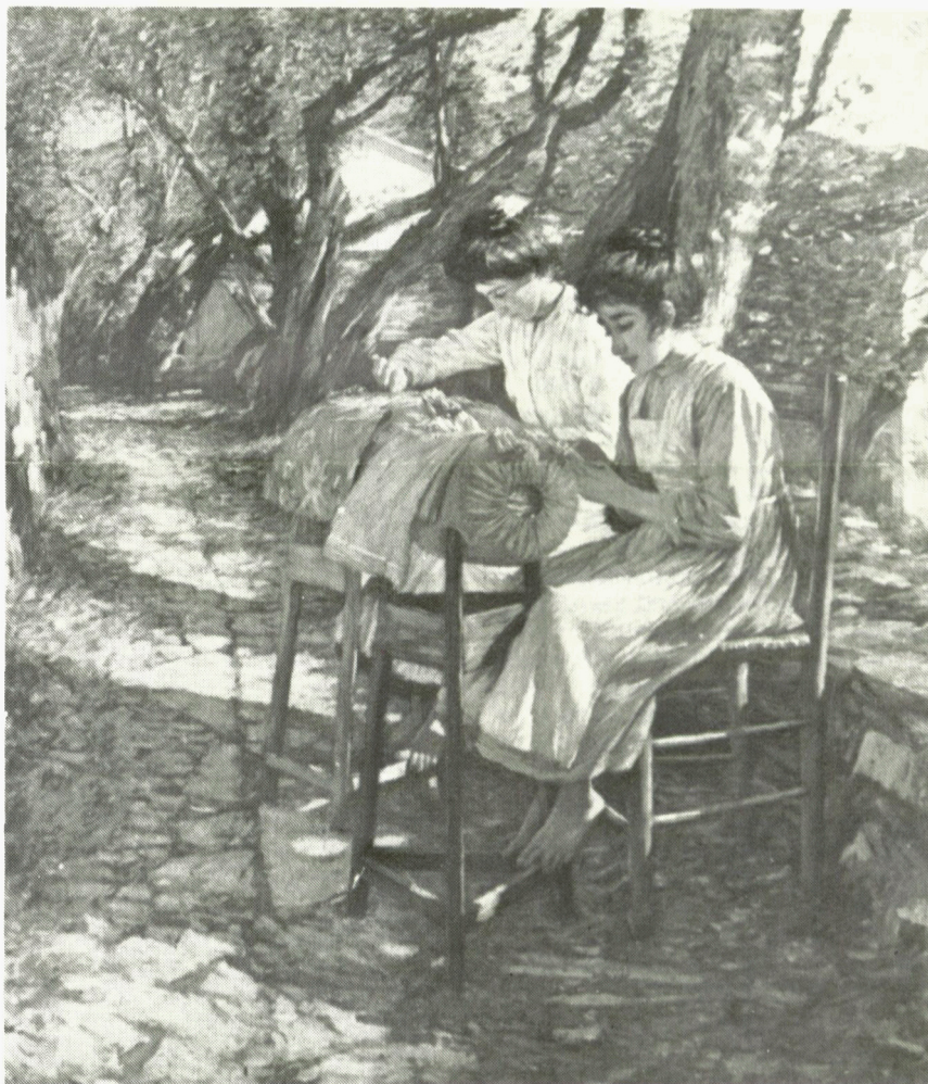
Picture of the Month for May. The Lacemakers by Henry La Thanque.

It is hoped that this column will not only tempt more people to come and view the art at the Gallery but also with the additional information about the work and the artist, will increase their pleasure in the works.