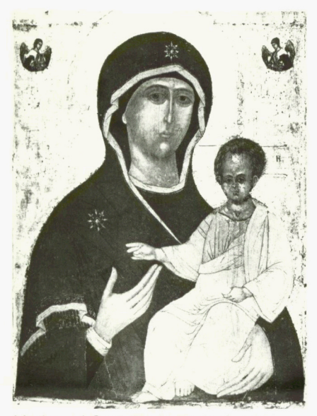
Mother of God, Hodegetria, School of Moscow, attributed to Dionysius, 15th century.

The 95 works in this exhibition are from the De Wijenburg Castle Collection near Nijmegen in the Netherlands where one of the finest private collections of orthodox art is housed. The exhibition covers a truly impressive range with examples dating from the 6th century Coptic portrait in the encaustic technique, to fine 15th and 16th century Cypriot, Cretan, Greek, and Byzantine works and involving a comprehensive survey of Russian icons from the North Russian, Novgorod, Moscow, and Jaroslavl schools, from the late 15th century to the 17th century.