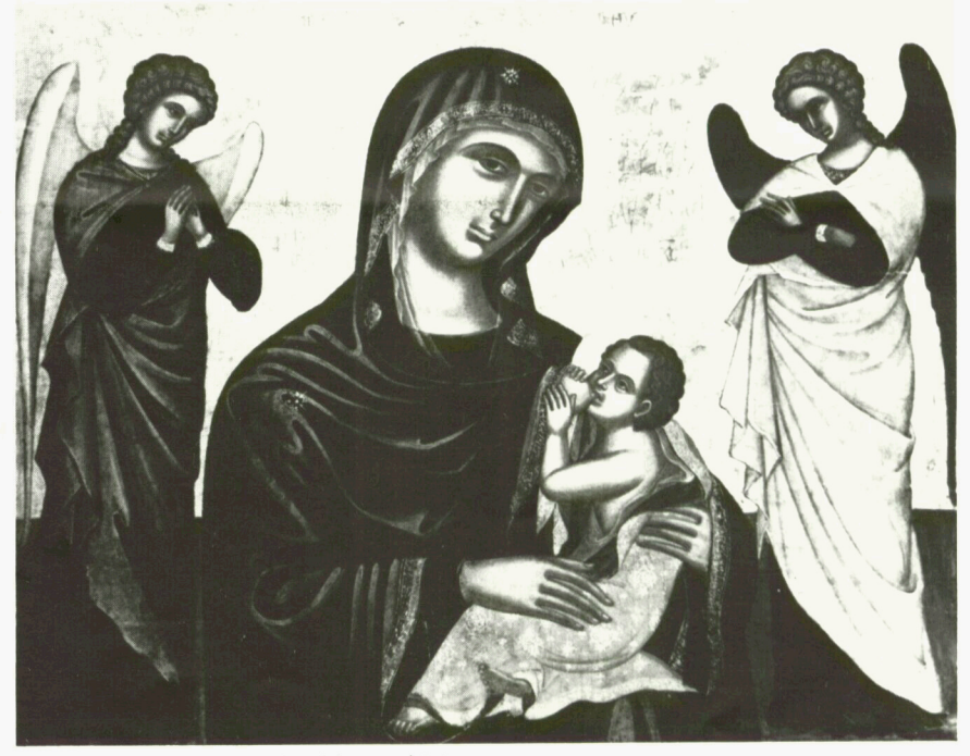
Galaktotrophousa, Venice/Crete, 15th century.