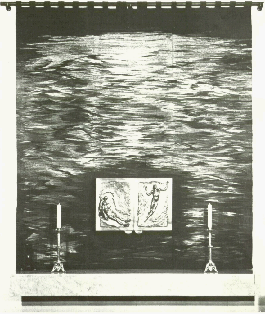
Tabernacle Screen Doors in situ at the Cathedral of the Blessed Sacrament.