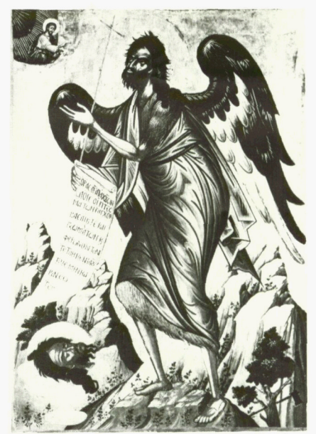
John the Forerunner in the Wilderness, Crete, circa 1600.

The ending of the iconoclastic controversy led to a great proliferation of icons, which was to continue for the next 600 years, as verified by the works in this exhibition. It also reinforced the need for strict clerical vigilance over the style, techniques and composition of the icon images and the initial rigid adherance to the basic iconography established by the 6th century and strictly observed in Byzantine religious art. Among the works in Ikon: Inspired Art therefore you will be aware of the strict uniformity of image despite the geographical or historical distances between their creation.