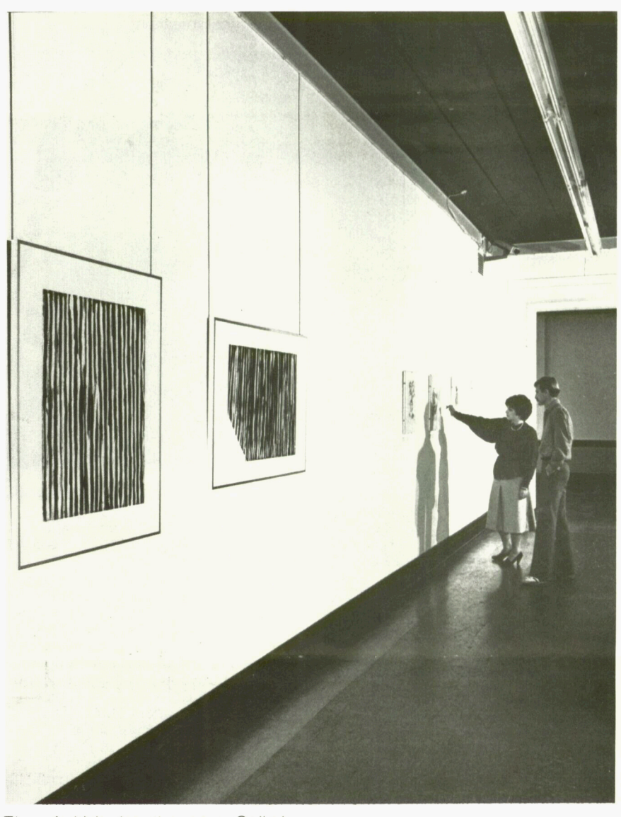
The refurbished north-eastern Galleries.

A very busy period at the Gallery is anticipated and our team of voluntary Gallery Assistants have been preparing for guided tours. We also plan a special sales table to handle the catalogues, reproductions, greeting cards, posters, slides, and other merchandise associated with lkon: Inspired Art , and we would be grateful for more volunteers to help us in this quarter. Members of the McDougall Art Gallery Friends Society who could spare us a few hours of their time between September 6 and November 2 and so participate in and contribute in this way, to this exciting and important exhibition, are asked to contact the gallery leaving their names with the receptionist.