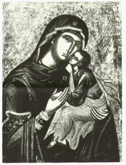
Maria Eleousa, Andrea Ricco di Candia, 15th century.

The painting techniques and the compositional conventions involved in the icon, provide an interesting and rewarding field of exploration and associated with the lkon: Inspired Art exhibition we have a wide range of didactic material including video and colour film, maps and charts, and we will try to ensure that a guide is on duty in the Gallery. There is also the pre-visit explanatory tape-slide programme 'Face to Face with the lcon' prepared by the Gallery and available for purchase or hire.