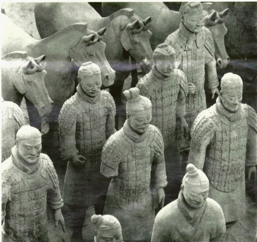
Terracotta Warriors & Horses at the Tomb of Qin Shihuang

Robert McDougall Art Gallery P.O. Box 2626, Christchurch Botanic Gardens Christchurch 1 Telephone 50-915