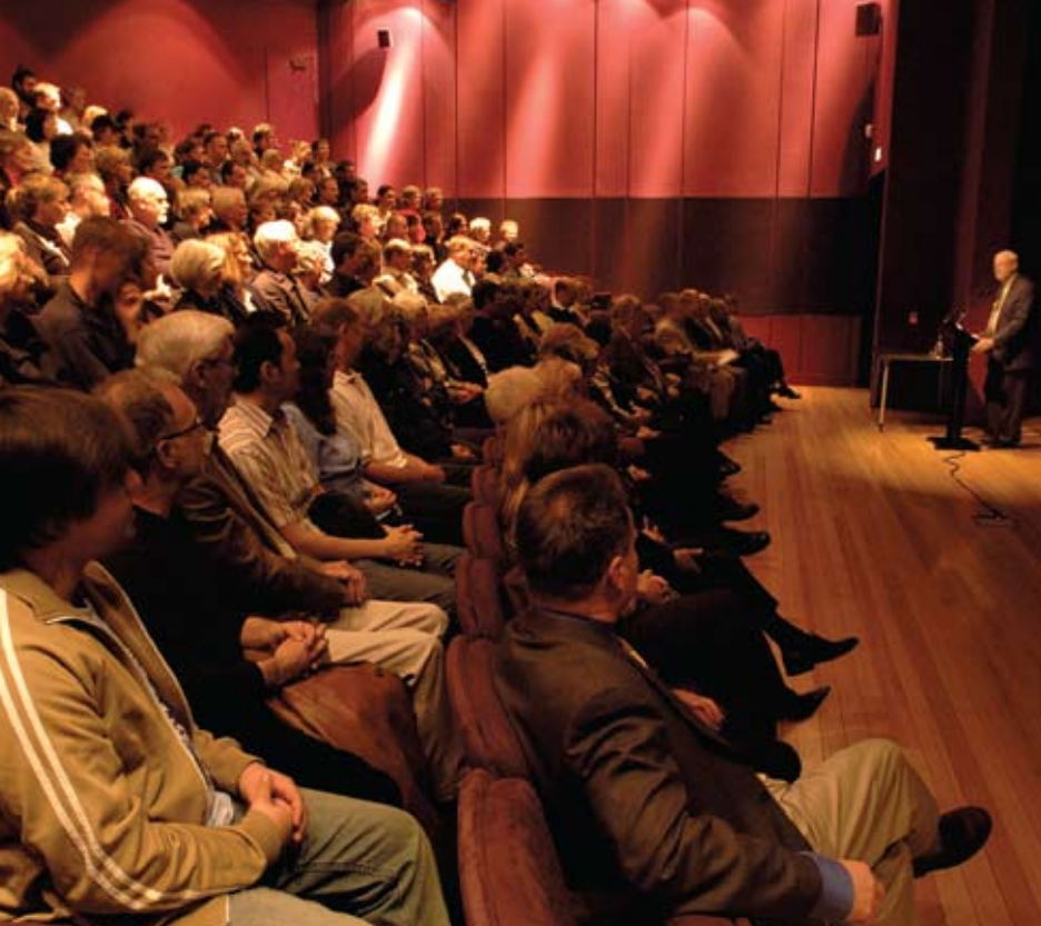
Philip Carter Family Auditorium