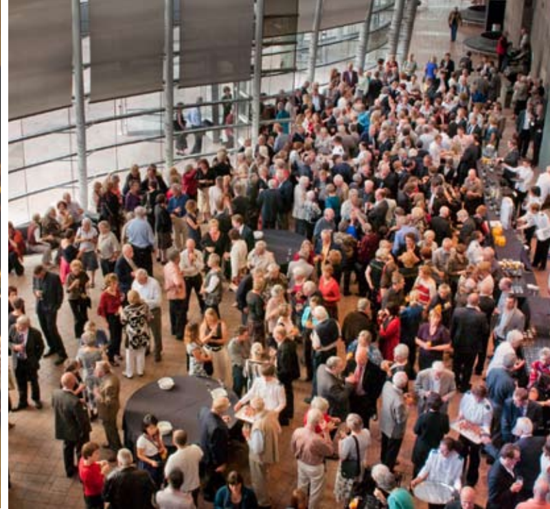
The spectacular Gallery foyer