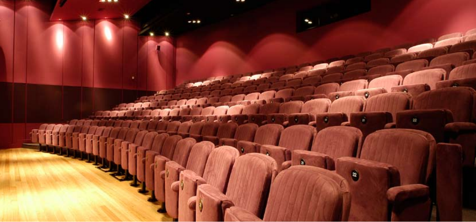
The Philip Carter Family Auditorium is ideal for performances, seminars and projection-based entertainment.